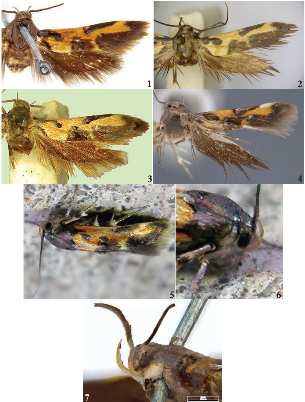
Figs 1–7. Euclementia spp. 1, E. woodiella , Holotype, Museum of Victoria, Melbourne. 2, E. woodiella , Natural History Museum London (specimen BMNH (E) #1324997) Kearsall Moor, Manchester. 3, E. woodiella , Manchester Museum, Kearsall Moor, Manchester. 4, E. schwarziella , Type no 5356 US National Museum, Santa Rita Mountains Arizona. 5, Euclementia sp. Lady Bird Johnson Wildflower Centre, Austin, Texas. 6, detail of 5 showing white palps and face. 7, detail of 1 showing white palps and face.