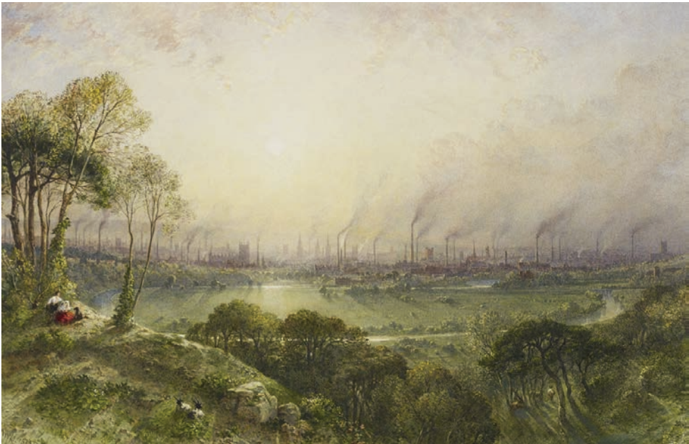
Fig. 10. Manchester from Kersal Moor . Water colour by William Wyld, 1852. Royal Collection Trust.